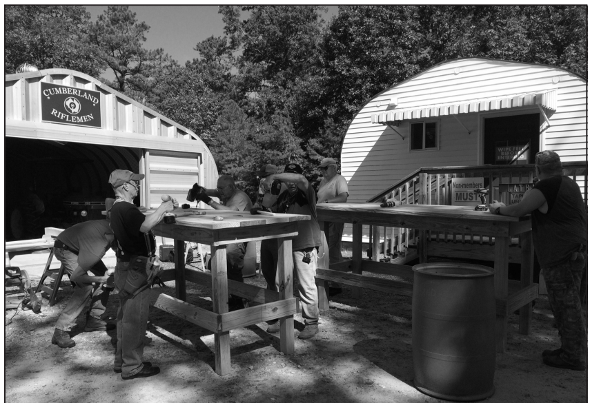
The builders of the benches for the new range, hard at work. Thanks to all involved.