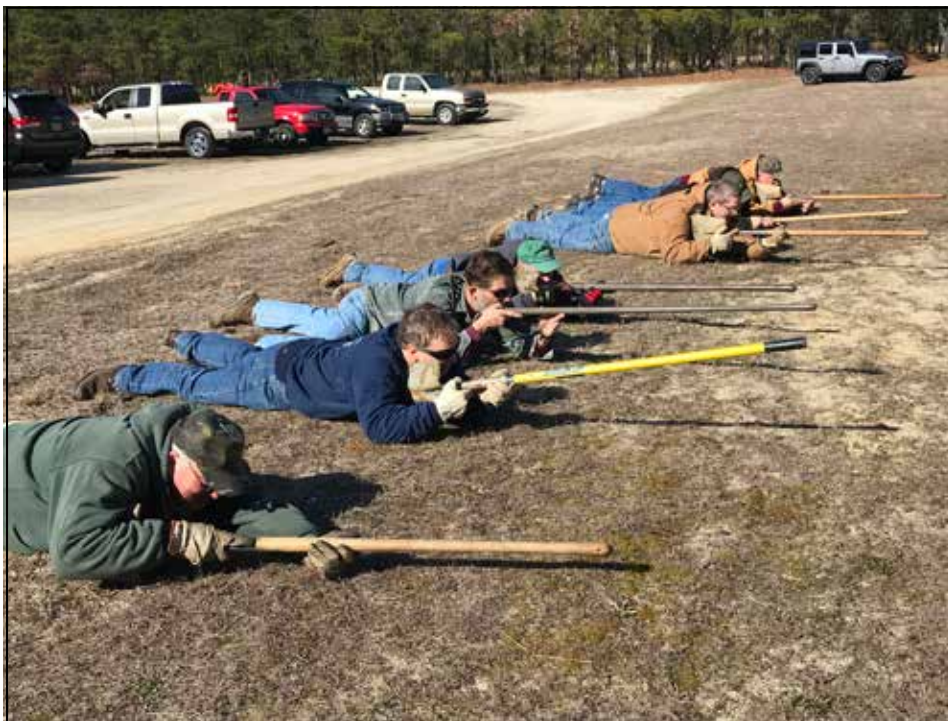
OK, guys. This is supposed to be a work party!