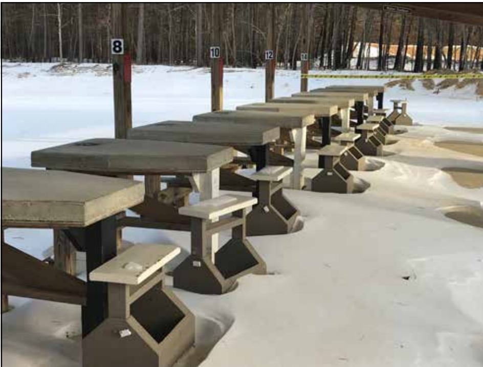
Remember last winter ???! No excuses now.