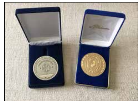
Black Powder medals for the June championship matches.