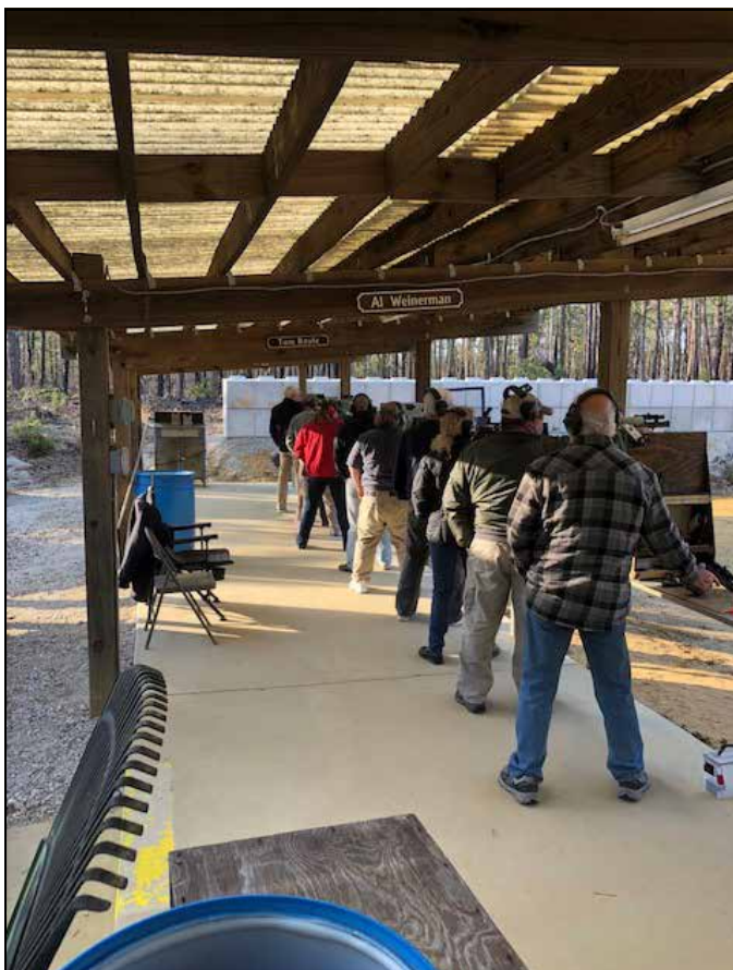
The firing line at a CRI pistol match. Lots of room left!