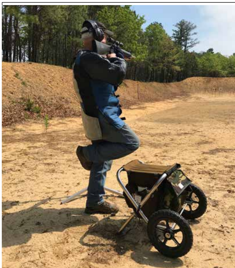
My wife and my teammates told me to stop acting like a flamingo. I had to put my foot down.

primer pockets are clean before re-priming. Either a primer pocket cleaning tool or a pin tumbling case cleaning does this just fine.