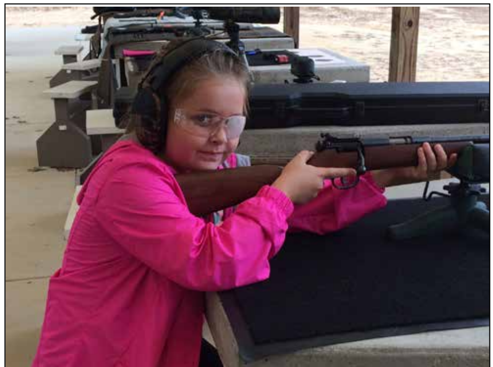
"Shoot like a girl in the CRI Junior Program ! Some of them are REALLY good !"