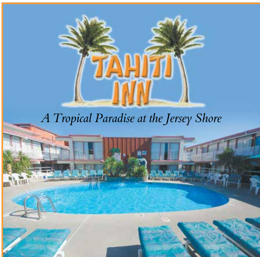
A Tropical Paradise at the Jersey Shore

12th & Ocean Avenue • Ocean City, NJ 08226 609-399-0130 • www.tahitiinn.com