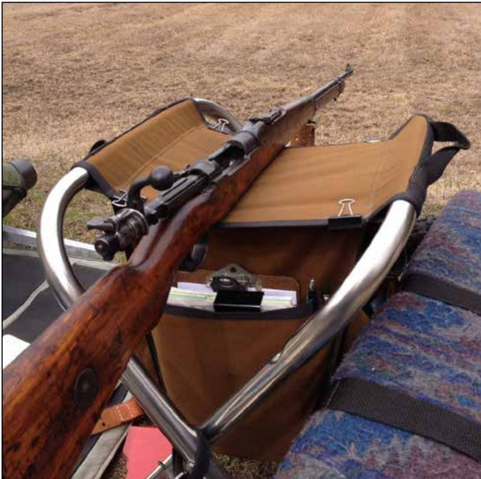
There's room for those old military rifles in the Garand/Springfield/Vintage matches! Bring 'em on out.