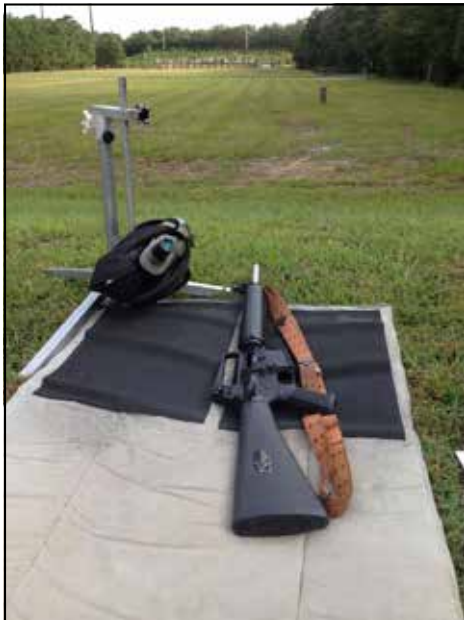
Stay in touch with Trenton and your representatives. We need to save these rifles, and all semiautos for that matter.

For every dollar we spend on medications, we spend another dollar to fix a complication caused by the medicine, sometimes by prescribing another medicine. Most conventional practitioners don't realize that drug safety and