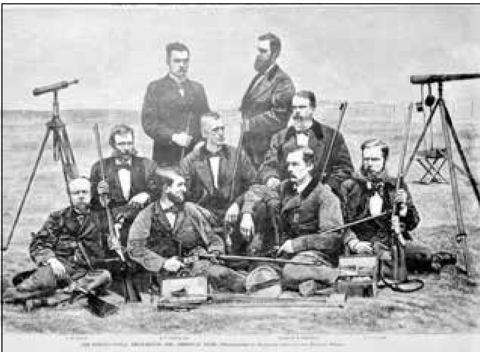
An early photo of the Creedmoor Match.